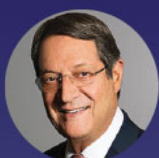
Nicos Anastasiades President Cyprus