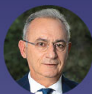
Averof Neofytou President The Democratic Rally Party (DISY) Cyprus