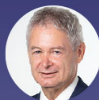
Andreas Mavroyiannis Former permanent representative of Cyprus to the UN Former negotiator for the Cyprus problem settlement