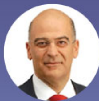
Nikos Dendias Minister of foreign affairs Greece