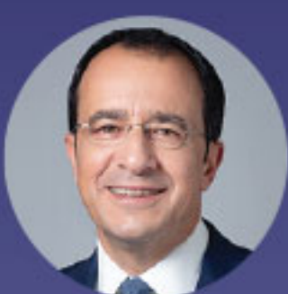
Nikos Christodoulides Former minister of foreign affairs Cyprus