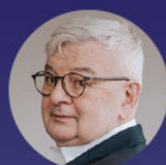
Joschka Fischer Former vice-chancellor Former minister of foreign affairs Germany