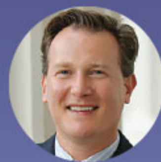
Andreas Borgeas State senator California State Senate