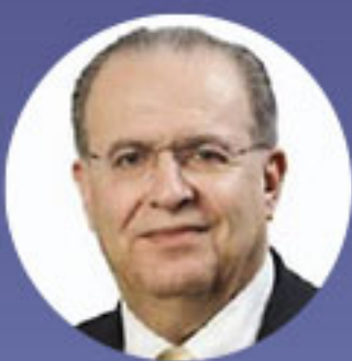
Ioannis Kasoulides Minister of foreign affairs Cyprus (recorded message)