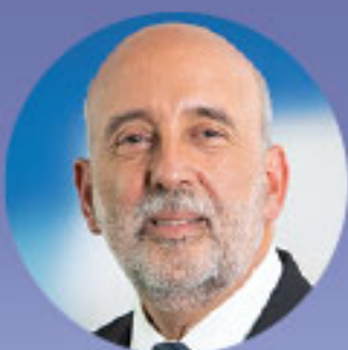
Gabriel Makhlouf Governor Central Bank of Ireland (via connection)