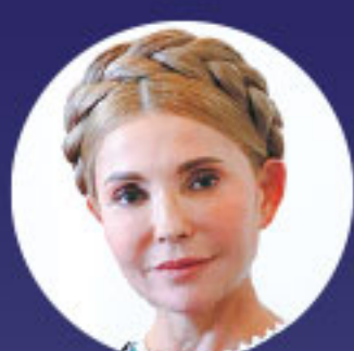
Yulia Tymoshenko Former prime minister Ukraine