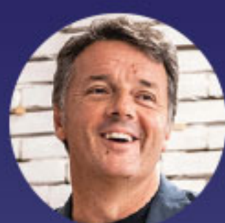
Matteo Renzi Former prime minister Italy