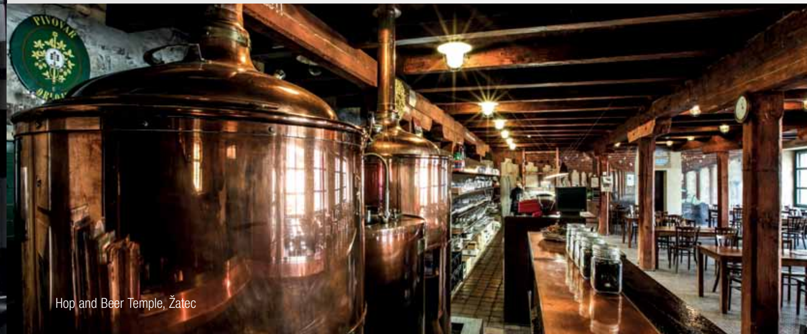
Hop and Beer Temple, Žatec