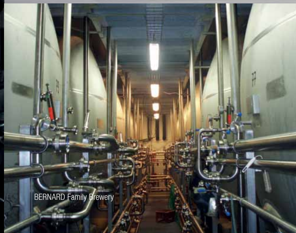
BERNARD Family Brewery