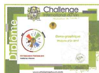
Ceno-graph diploma Your wine tasting comments in image available on www.challengeduvin.com