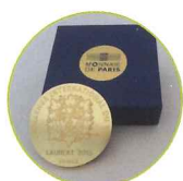
Medal struck by Monnaie de Paris Ø 6.5 cm