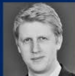
Jo Johnson Former director of policy, No.10 Downing St, & former minister of state for universities