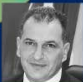
Yiorgos Lakkotrypis Minister of energy, commerce and industry Cyprus