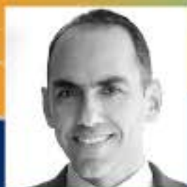
Harris Georgiades Minister of finance Cyprus