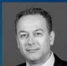
Panicos Nicolaou CEO Bank of Cyprus