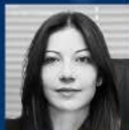
Demetra Kalogerou Chairwoman Cyprus Securities and Exchange Commission