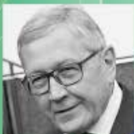
Klaus Regling Managing director European Stability Mechanism (ESM)