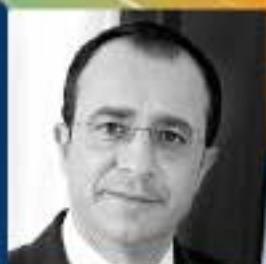
Nikos Christodoulides Minister of foreign affairs Cyprus