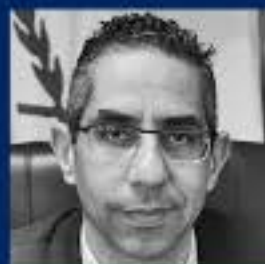
Savvas Angelides Minister of defence Cyprus