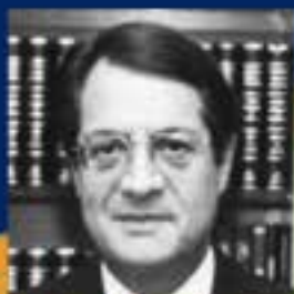
Nicos Anastasiades President Cyprus