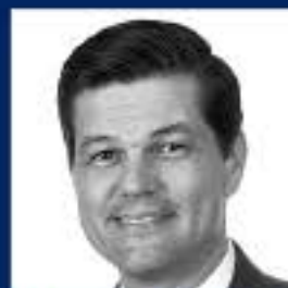
Wess Mitchell Former US assistant secretary of state for European and Eurasian affairs