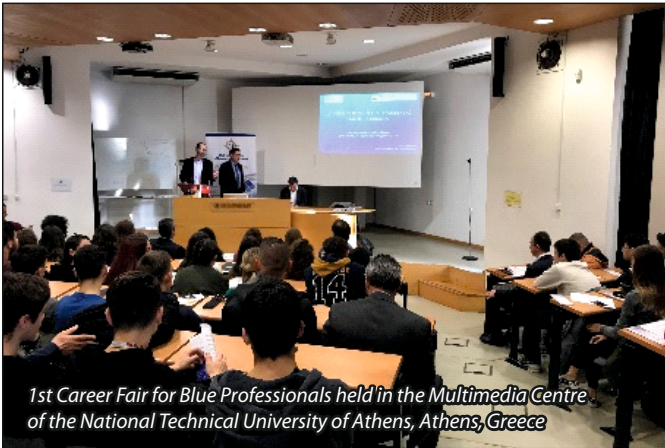
1st Career Fair for Blue Professionals held in the Multimedia Centre of the National Technical University of Athens, Athens, Greece

The National Technical University of Athens (NTUA) and in specific the Laboratory for Maritime Transport organized and hosted the 1st Career Fair for Blue Professionals for Greece in the Multimedia center of NTUA at the ground floor of the Central Library Building in the Zografou Campus. This event took place on Tuesday December 5th, 2017.