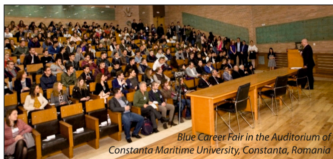
Blue Career Fair in the Auditorium of Constanta Maritime University, Constanta, Romania

The event was divided into two sections as the first part of the day was dedicated to the presentation of the MENTOR project purpose and informational speeches followed by extended debates between employers, future employees (school learners, students and graduates) and local authorities, on the