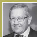
Klaus Regling Managing director European Stability Mechanism (ESM)