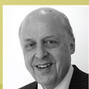
John Negroponte Former US deputy secretary of state