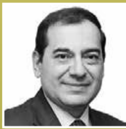
Tarek El-Molla Minister of petroleum and mineral resources Egypt