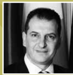
Yiorgos Lakkotrypis Minister of energy, commerce, industry and tourism Cyprus