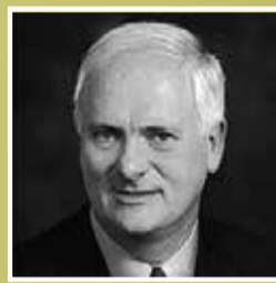
John Bruton Former prime minister Ireland