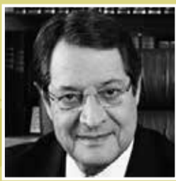
Nicos Anastasiades President Republic of Cyprus