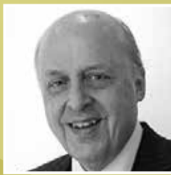
John Negroponte Former US deputy secretary of state