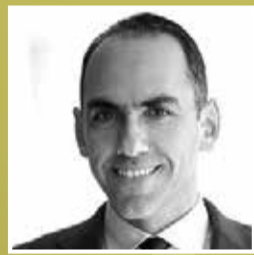
Harris Georgiades Minister of finance Cyprus