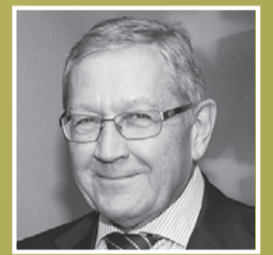
Klaus Regling Managing director European Stability Mechanism (ESM)