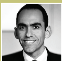
Harris Georgiades Minister of finance Cyprus