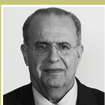
Ioannis Kasoulides Minister of foreign affairs Cyprus