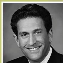
James Rubin Fmr US assistant secretary of state for public affairs, adviser on politics and international affairs