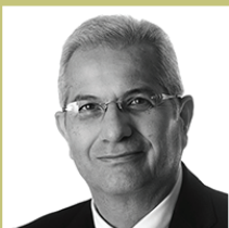
Andros Kyprianou General Secretary of the Central Committee Progressive Party of the Working People (AKEL)