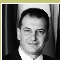
Yiorgos Lakkotrypis Minister of energy, commerce, industry and tourism, Cyprus