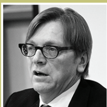
Guy Verhofstadt Chair Group of the Alliance of Liberals and Democrats for Europe in the European Parliament, former prime minister of Belgium