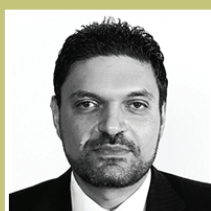
Constantinos Petrides Deputy minister to the president of the Republic of Cyprus