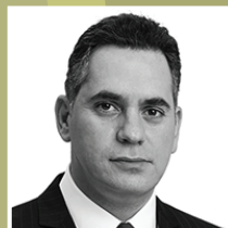
Nicholas Papadopoulos President Democratic Party (DIKO)