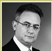
Averof Neofytou President Democratic Rally Party (DISY)