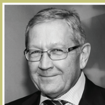
Klaus Regling Managing director European Stability Mechanism