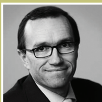
Espen Barth Eide Special adviser to the secretary-general on Cyprus United Nations