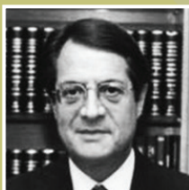
Nicos Anastasiades President Republic of Cyprus